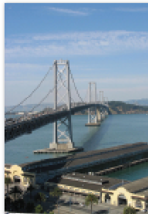
The view from the Watermark