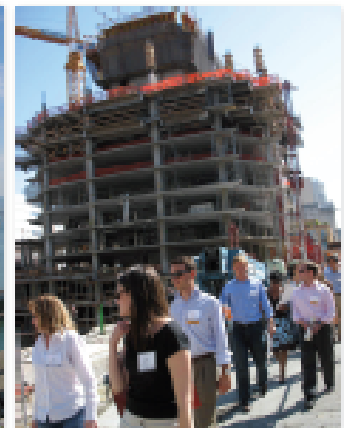
Young leaders check out Tishman Speyer's The Infinity